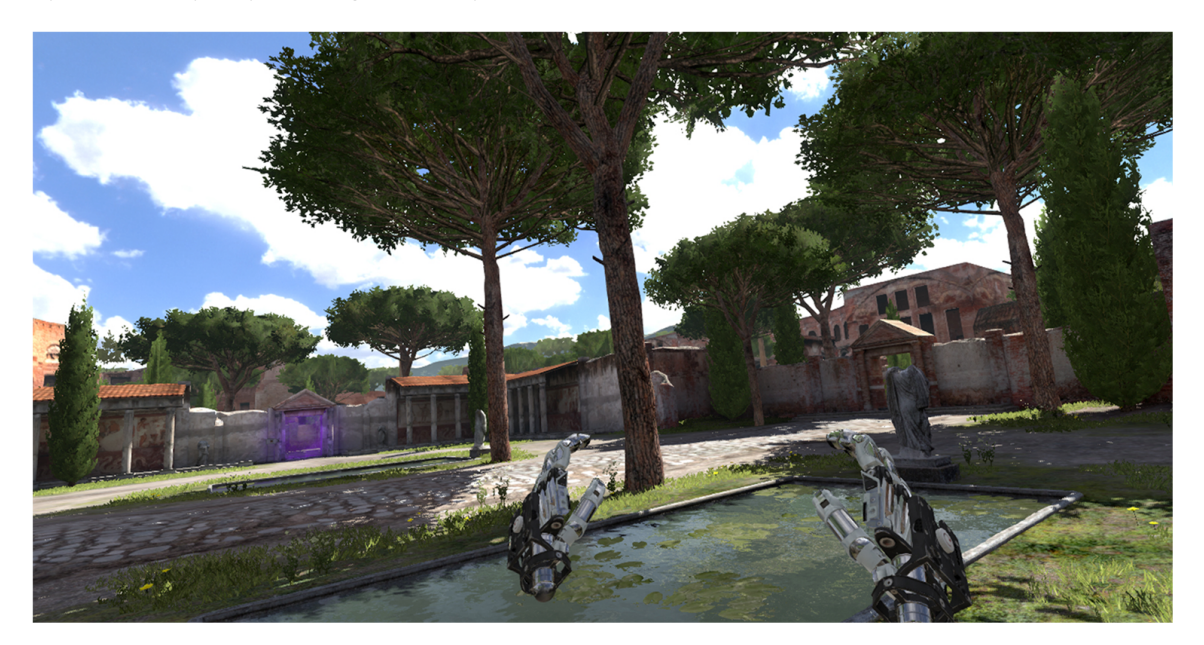
» Figure 1: Scenery of the Talos Principle VR game

The test procedure was as follows: first, the participant was seated, and their current level of stress was recorded with the Pip biosensor during a 2-minute time interval. The person was then asked general questions regarding their age, gender, and previous experience with VR. Afterwards, they were familiarized with the VR headset, and shown how to use the controllers to