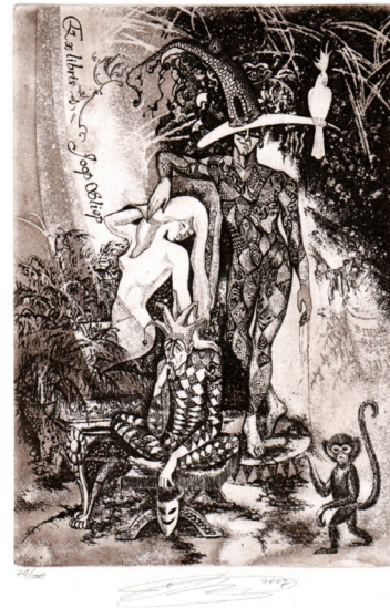
» Figure 6: Naboka O. Ex libris J. Sleep. Etching, aquatint, mezzotint. 2007

Such a combination of technological experimental research, complicated by introduction of mezzo-tint, as is done, for example, by the Kyiv artist Oleh Naboka (Figure 6) is of additional interest. At the same time, sheets remain monochrome, while, for example, the works of Mykhailo Drimaylo are polychrome (Figure 7) following Roman Romanyshyn from Lviv. He works in the same combination of techniques – etching with aquatint. Introduction of additional (especially bright) colours into graphic sheets in mixed technique gives them decorativeness, in some cases – even lubok features (R. Romanyshyn, M. Drimaylo), variegation.