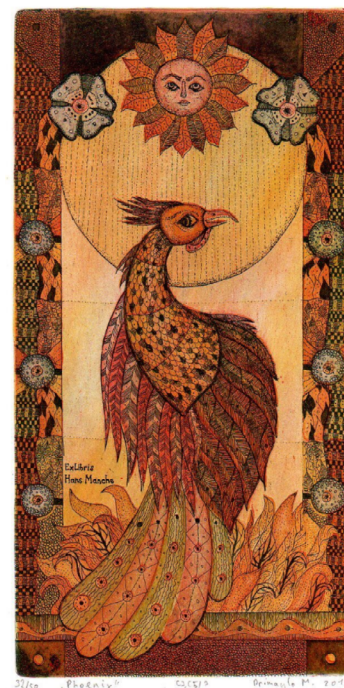
» Figure 7: Drymaylo M. Ex libris H. Manche. Etching, aquatint. 2019