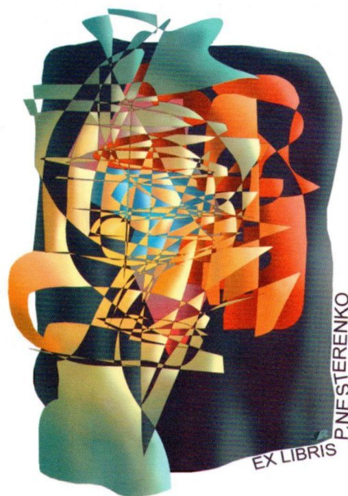
» Figure 1: Vygovsky R. Ex libris P. Nesterenko. C.A.D. 1997.