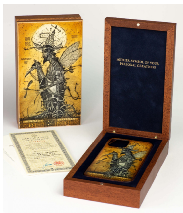
» Figure 11: Denysenko O. «Flying Pilgrim»: Etching (1997), geography (2021), iPhone in a case with geography and a mahogany case