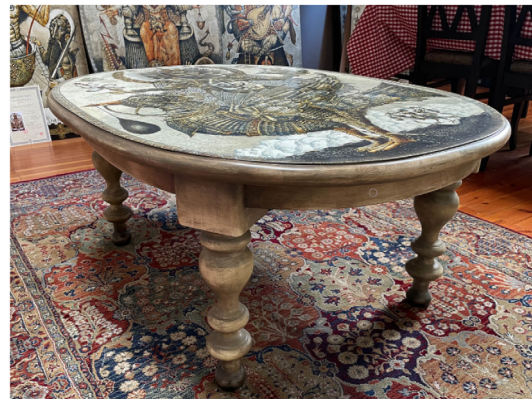
» Figure 10: Table with gesography by O. Denysenko "Four elements – air"