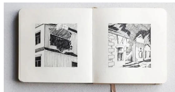
» Figure 3: Semenova A. Artbook “Visual war diary”. 2023

This is how the art book 2023 which covers everyday life of refugees from Ukraine in 2022 was used – the project “Visual Diary of War” includes illustrations by Antonina Semenova, was presented in one of the Dnipro museums (Figure 3).