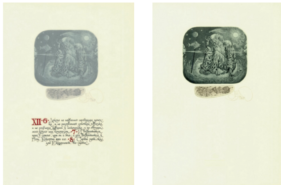
» Figure 4: Kalynovych K. Book «Ecclesiastes» or Preacher. Etching, calligraphy, relief stamping, hand cast paper. 2012

Already in 2012 a printed version was created, also with illustrations using the intaglio technique (Figure 4). Several years were spent on this work, it became the fruit of collective labor. This work is created in classical traditions of the French livre d'artiste with unbound sheets (Markov & Aveliev, 2012). The text was made by Dmytro Bugaienko using the silk-screen technique, German hand cast paper “Hahne Muhle” (300 g/m 2 ) became its basis, gift