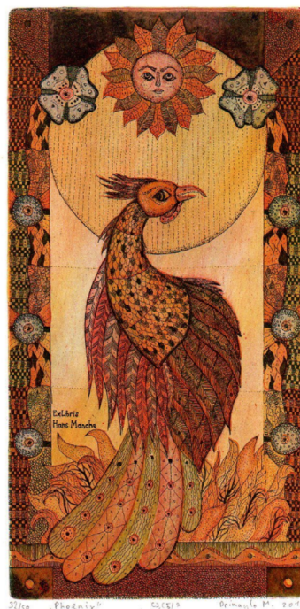
» Figure 7: Drymaylo M. Ex libris H. Manche. Etching, aquatint. 2019