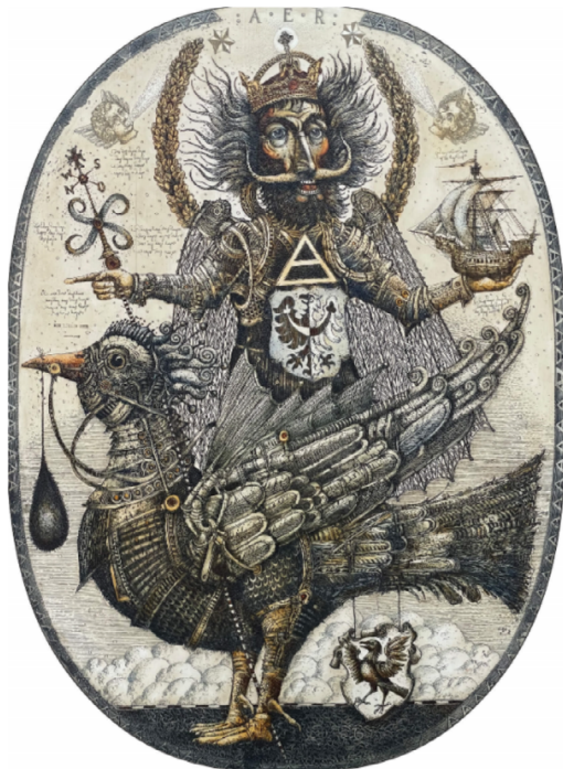
» Figure 9: Denysenko O. “Four elements – air”. Gesography. Wood, levkas, oil. 2021

Thus, compositions “Flying Pilgrim” and “Four Elements: Air” (Figure 9) have “double life”, both existing as independent gesographies as well as applied works: the image of a pilgrim became an adornment for an iPhone case and a box for it, having turned into a VIP accessory decor, and allegories of the four elements were transferred as table decor base (Figure 10) transforming the interior of the 21st century into a medieval castle or a Renaissance palace accessory, stretching red thread between eras. Thus, the master demonstrates transformation of a work being subjected to peculiar technological “mutations”, exploiting the same composition in different techniques – first as an etching, then as a gesography, and finally, as a base for decor of an applied work of art, or rather, thanks to this work, turning an everyday circulation item into an exclusive work of high art (Figure 11).