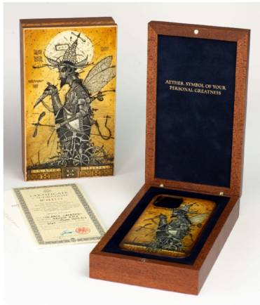
» Figure 11: Denysenko O. «Flying Pilgrim»: Etching (1997), geography (2021), iPhone in a case with geography and a mahogany case